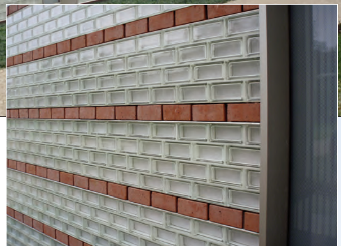
Brockman Hall at Rice University // VUE® Pattern with "LX" insert New 4" x 4" x 4" glass block used with 4" x 8" x 4" glass block.

Pittsburgh Corning has a sales and technical support team that is ready to help you design, engineer and specify glass block solutions. Please visit our website at pittsburghcorning.com or call 800-871-9918 for assistance.